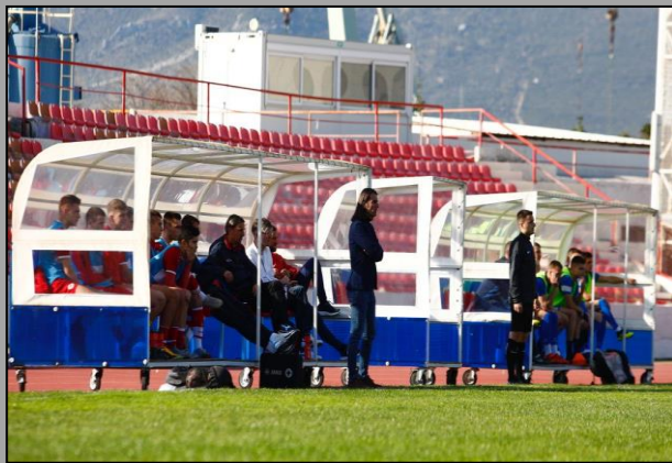
Trainer First Team RNK Split 2018.