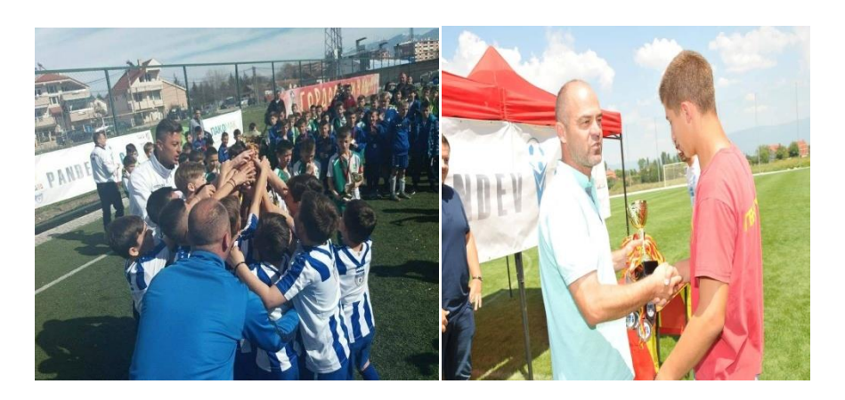
Every year organizing Pandev Camp with 350 participiants: